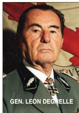
GEN. LEON DEGRELLE

When this vibrant Warrior for the West—a much-decorated survivor of the brutal Eastern Front—died in Spain in 1994, he was the last surviving major figure of World War II,